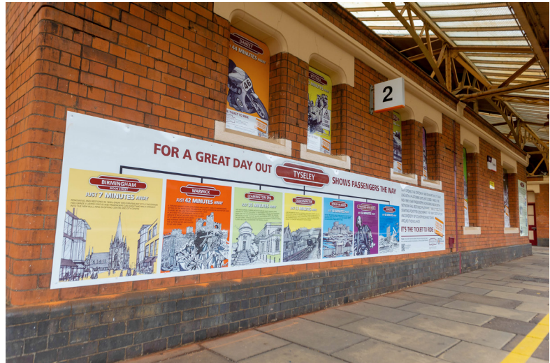
Tyseley station where in March 2023 FoSL designed art boards, displaying daycation destinations by train & local social history, have been erected on all four platforms improving the station environment

The combined sum of value from the commitment by volunteers has attracted over £460,000 pounds of investment along the railway line between Birmingham and Stratford upon Avon. That is supporting the local economy, education, & heritage - and all promoting the use of environmentally sustainable travel.