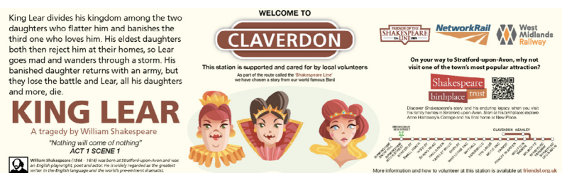
Concept design of bringing Shakespeare to the Shakespeare Line

With around 7 million rail passenger journeys made from and to Birmingham Moor St station the impact and influence upon travellers is significant. Highlighting the time and carbon emissions benefits of train travel the poster represents a new, innovative and less corporate approach to marketing designed to encourage visitors to South Warwickshire and thus support its local economy while minimising the environmental effect of travel.